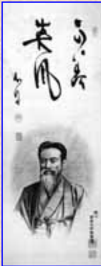
Tesshu Yamaoka (select image to view)

Sensei, besides your training in Daito-ryu, you have been studying the life and works of Tesshu Yamaoka [1836-1888], who was a master of Zen and the sword. You also have a wonderful collection of his calligraphy. Would you tell us something about him?