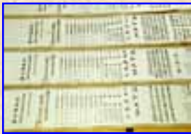
Menkyo kaiden transmission scrolls awarded Kondo by Headmaster Tokimune Takeda (select image to view)